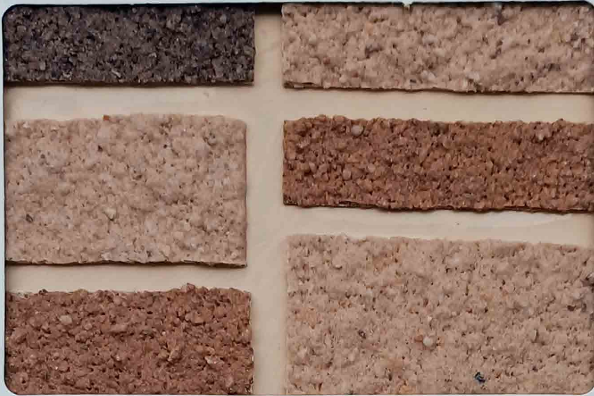
GS204-A, GS204-C, GS204-B